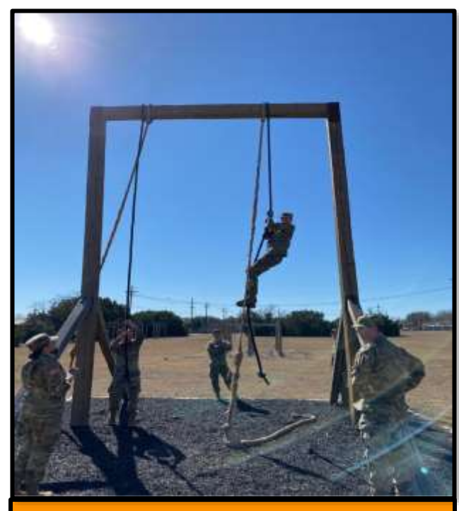
MSII Cadets conducting the III Corps Obstacle Course at Fort Hood during a visit to retrieve their Common Access Card.